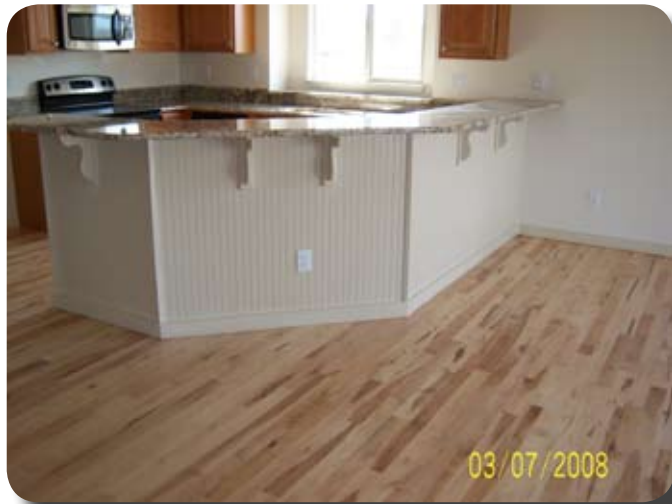
A separating residential breakfast bar with the electrical outlet properly situated per the NEC.

An often overlooked receptacle required by the National Electrical Code (NEC), can be found by referencing 210.52 (A) (2) (3). 210.52 (A) specifies which walls are required to be included in the receptacle layout in a dwelling unit. 210.52 (A) (3) includes the space provided by fixed room dividers such as free-standing bar-type counters or railings. The NEC requires that a receptacle be placed within 6 feet of the end of the wall that is