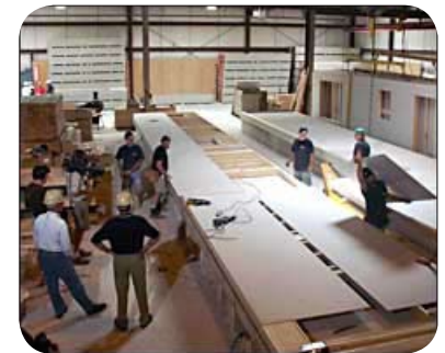
Constructing a modular building

Modular buildings are most often designed and constructed for use as residential dwellings, portable classrooms, offices or telecommunication buildings and can also be assembled in multiple sections to create larger multi-story residential or commercial structures.