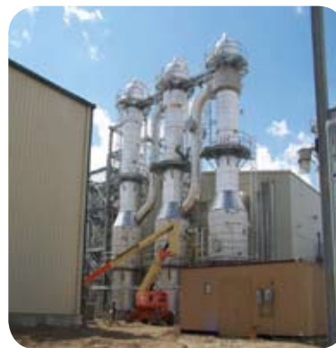
Rocket - like evaporators

Housing construction in southern Idaho has slowed down quite a bit. Fortunately, there is a lot of commercial work ongoing and our inspectors have kept busy through the winter. In Jerome, construction of a new Darigold milk plant is well underway, a new 108 unit motel is being built and the area's newest automobile dealership is about half-way completed.