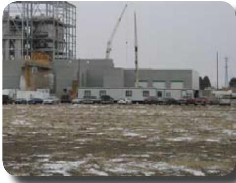
Construction proceeds on the High Desert Milk plant in Burley. The plant will be in production in the fall of 2008.

sq. ft. and larger. Aside from that, residential construction is off significantly.