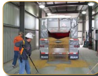
A Semi truck unloads corn for the first batch of ethanol at Pacific Ethanol's Burley facility. Most of the plant's future grain shipments will arrive by rail car.