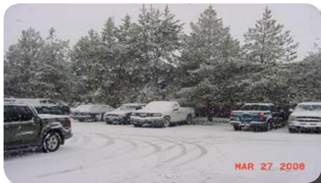
The snow just kept coming in N. Idaho this winter. Here is the parking lot of our Coeur d'Alene office in late March.

Late January and early February 2008, brought record snowfall to Idaho, especially in the northern half of the state. Governor Otter added county after county to an emergency disaster decla-